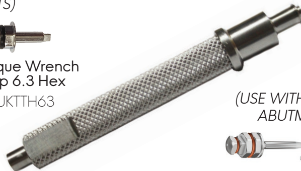
Magic Tool Insert Insertion