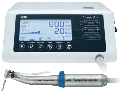
MODEL Surgic Pro (optic) CODE Y1003586 RRP £6,212

Including the new stylish Surgic Pro2 with a cordless foot control, offering wireless connectivity to VarioSurg4 and Osseo 100+.