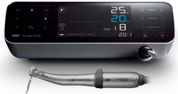
MODEL Surgic Pro2 (optic) CODE Y1004195 RRP £6,212