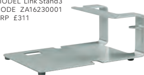
MODEL Link Stand3 CODE ZA16230001 RRP £311

Link Stand for VarioSurg 4 / Surgic Pro2