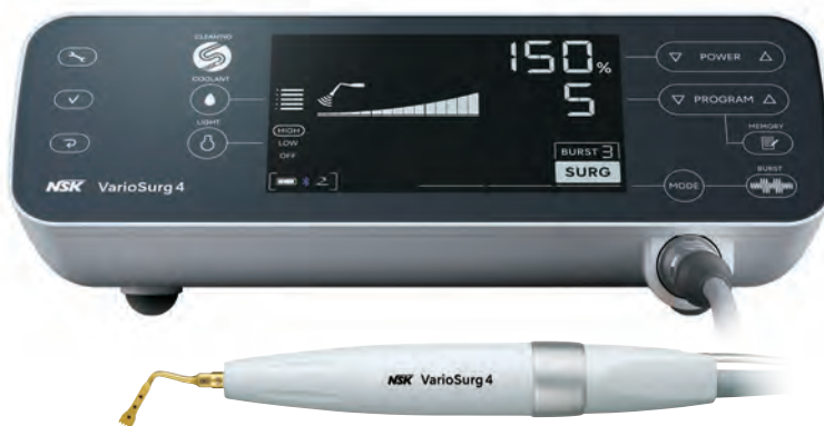
MODEL VarioSurg 4 CODE Y1500706 RRP £8,369 (option with corded foot pedal Y1500712 + Z1102003)