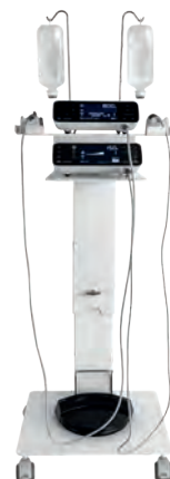
MODEL iCart Duo CODE S9090 RRP £1,041