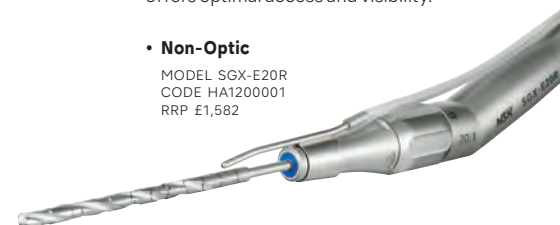
MODEL SGX-E20R CODE HA1200001 RRP £1,582