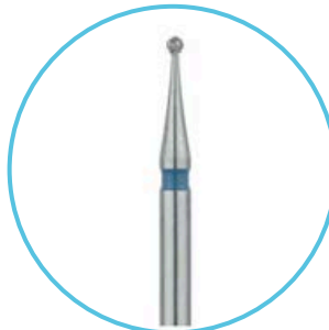
Meisinger Diamond Bur Round