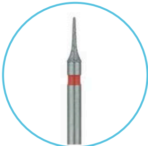
Meisinger Diamond Bur Interproximal

Meisinger diamond instruments consist of a shank and a hardened, stainless profile body coated by means of the most modern galvanising process with selected diamond grains. This guarantees an extremely homogenous, safe and lasting diamond coating of the instruments and thus optimal working results. In addition, you are guaranteed a choice from up to seven different grain sizes.