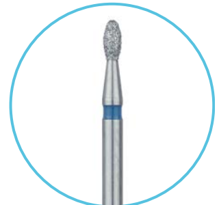
Meisinger Diamond Egg Bur