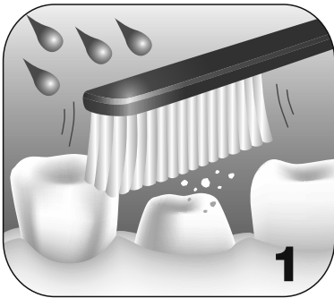
Clean old cement from tooth prep.