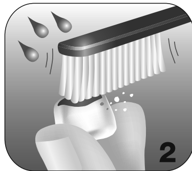
Clean old cement from crown.