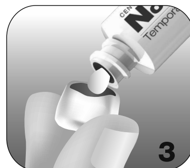
Open tube and remove foil seal. Squeeze a small amount inside of crown.