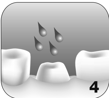
Moisten tooth prep.